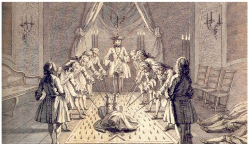
Masonic Initiation Ritual

So the modern reality, if we understand it correctly, will be similar in some ways - the injection of a needle (and computer chip) into the skin. And as in tribal societies, where members can be recognized by the marks they bear or by the ornaments they wear, so in the Beast's “tribe” its members can be recognized by their “mark of the beast” .