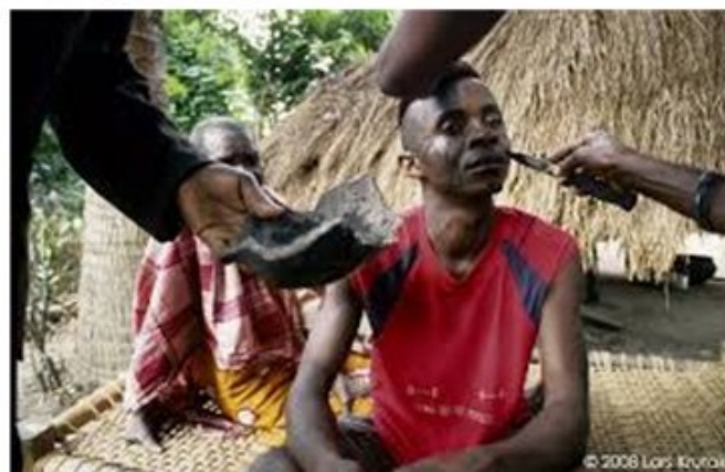
African Tribal Initiation

So the mark serves, not only as an efficient way to provide financial organization for the world's huge population, but receiving it will also be an act of submission or