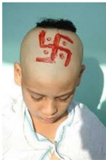
Young Hindu Devotee