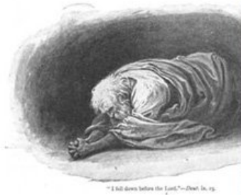
The old way