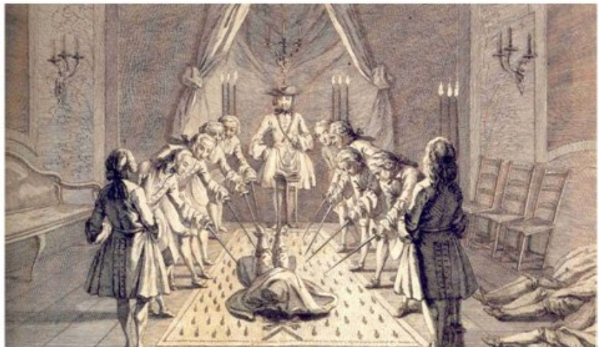
Masonic Initiation Ritual

So the modern reality, if we understand it correctly, will be similar in some ways - the injection of a needle (and computer chip) into the skin. And as in tribal societies, where members can be recognized by the marks they bear or by the ornaments they wear, so in the Beast's "tribe" its members can be recognized by their " mark of the beast ".