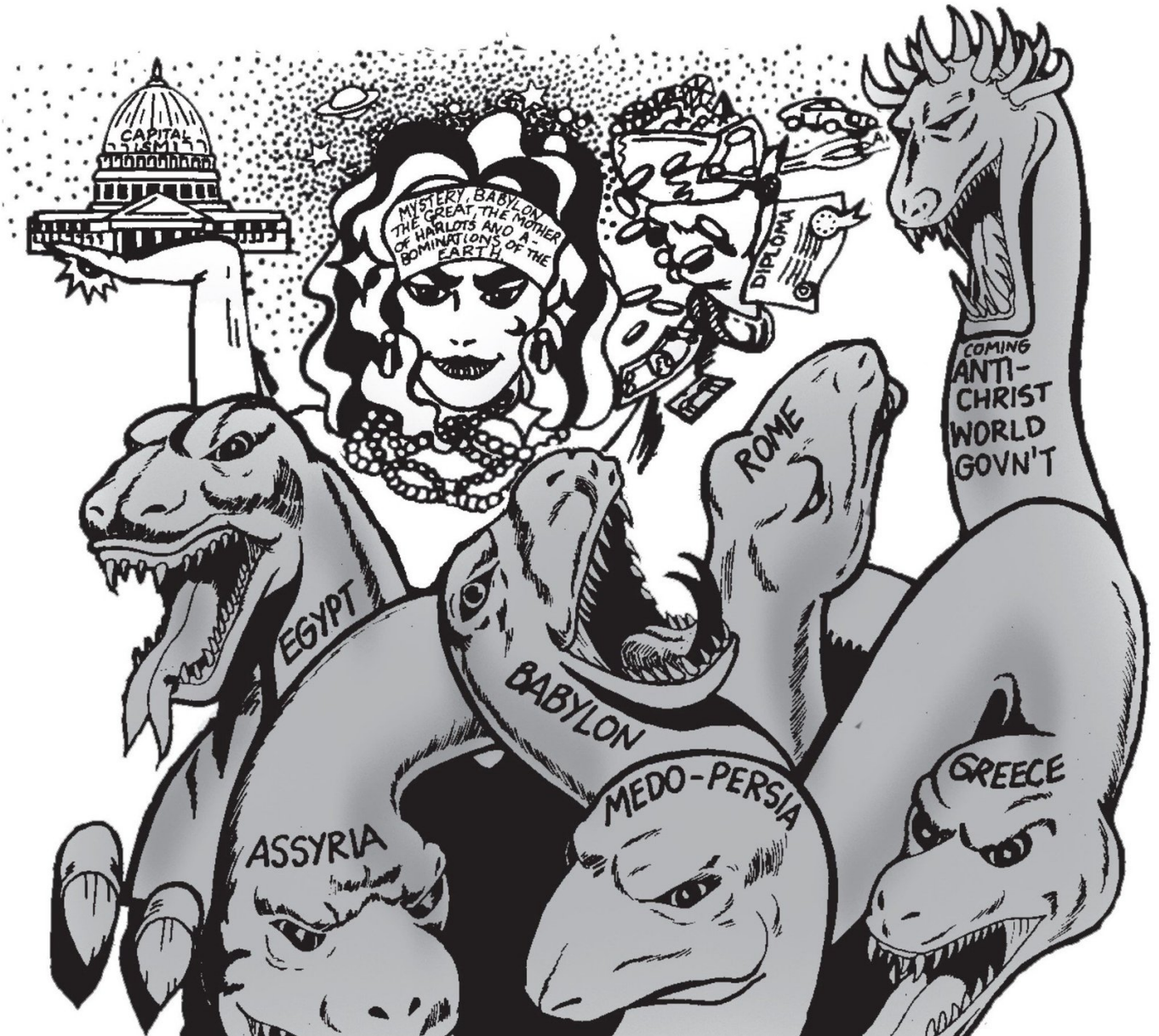
Illustration from publication of The Family International

The Ten Horns and their activities, as we shall learn further ahead, are a particular feature of the Beast that manifests in the End of the Age, along with the simultaneous existence of an 8th Beast (mentioned in 17:11).