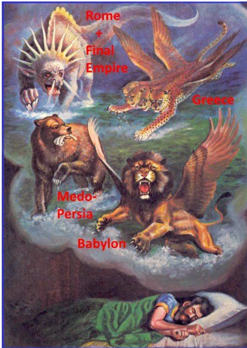
Daniel's Dream of Four Beasts

dreamland. This is a pattern that started long ago in the city of Babel where its dwellers said they wanted to “build ourselves a city, and a tower whose top is in the heavens; let us make a name for ourselves, lest we be scattered abroad.” (Genesis 11:4)