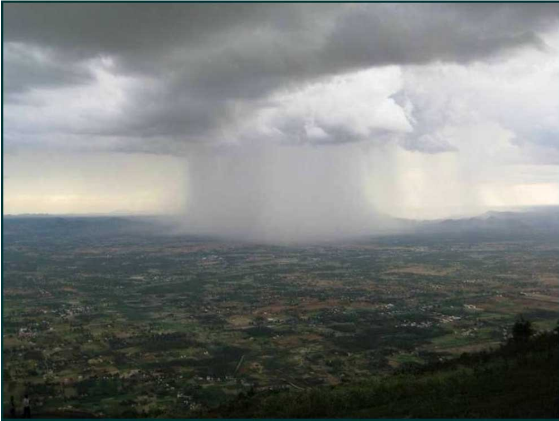
Rainfall: Spectacular scene in Bangalore, India, as viewed from the Nandi Hills