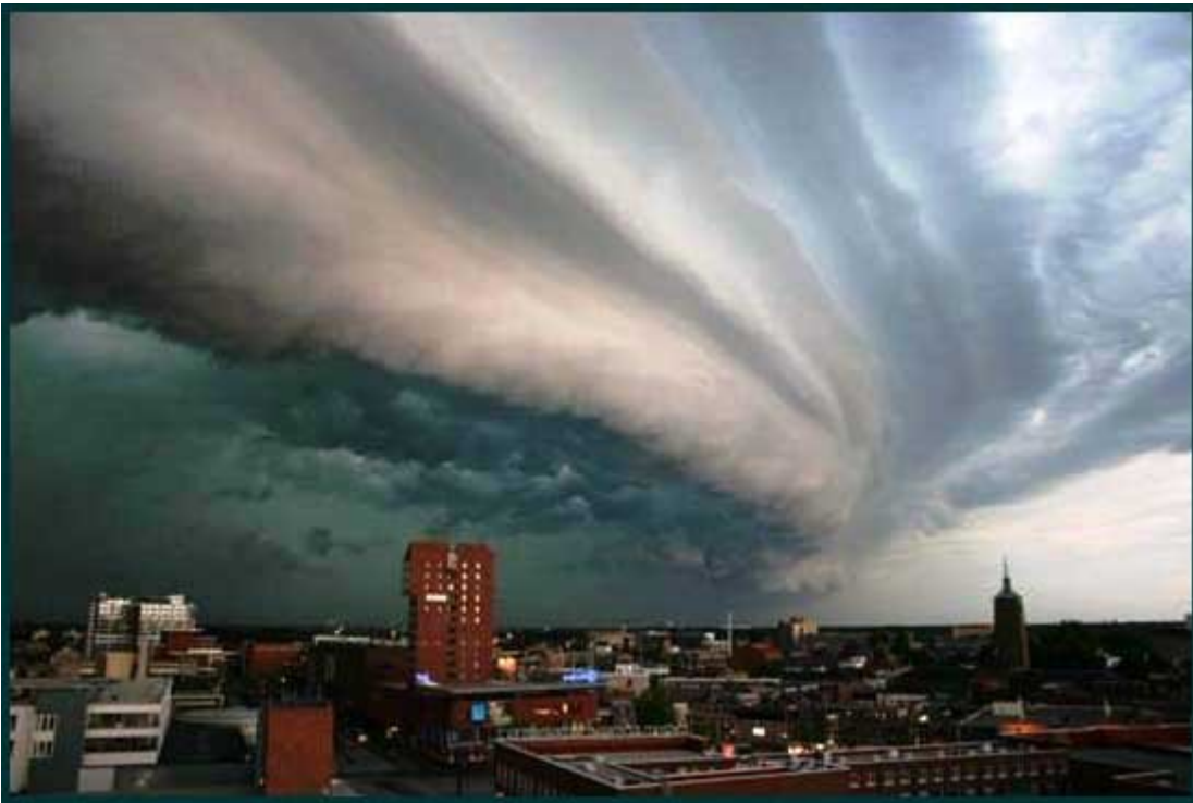
Clouds: A shelf cloud associated with a heavy or severe thunderstorm over Enschede, Netherlands

3-E: Early Migration Before the Rise of Civilization