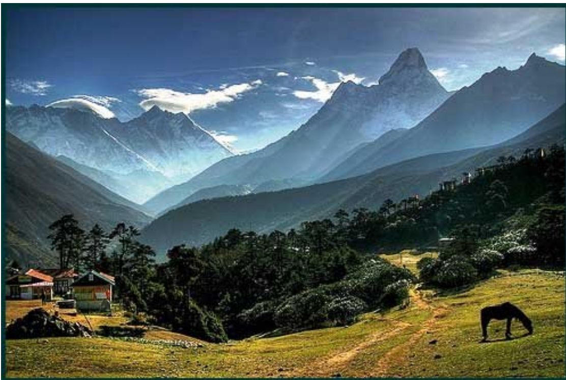
High and Rugged Mountain Ranges: Scene from Himalyan Mountains