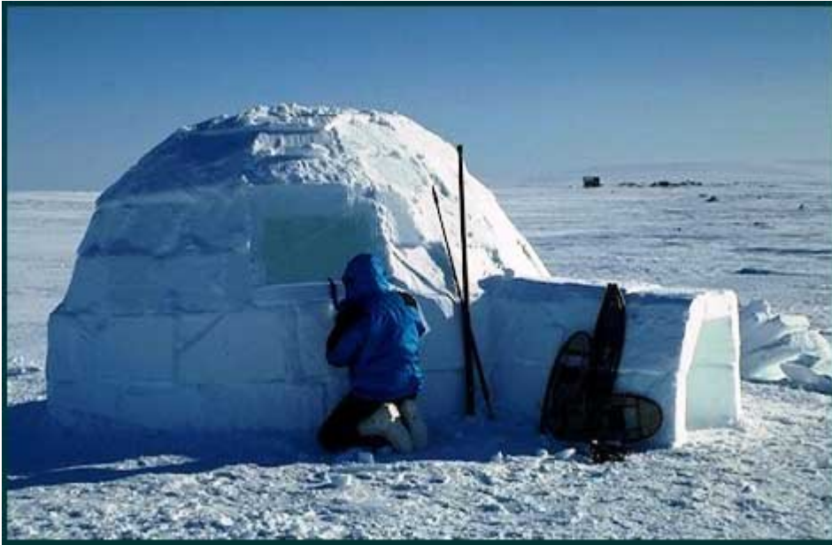
Frigid Polar Regions

so high that utility poles were nearly buried.