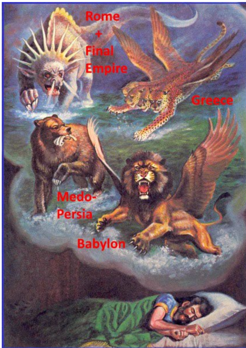
Daniel's Dream of Four Beasts

To be precise though, it is really a question of the modern empire arising out of the ancient one. And the horns are attached to the modern version of this Beast, not to the ancient Roman version.